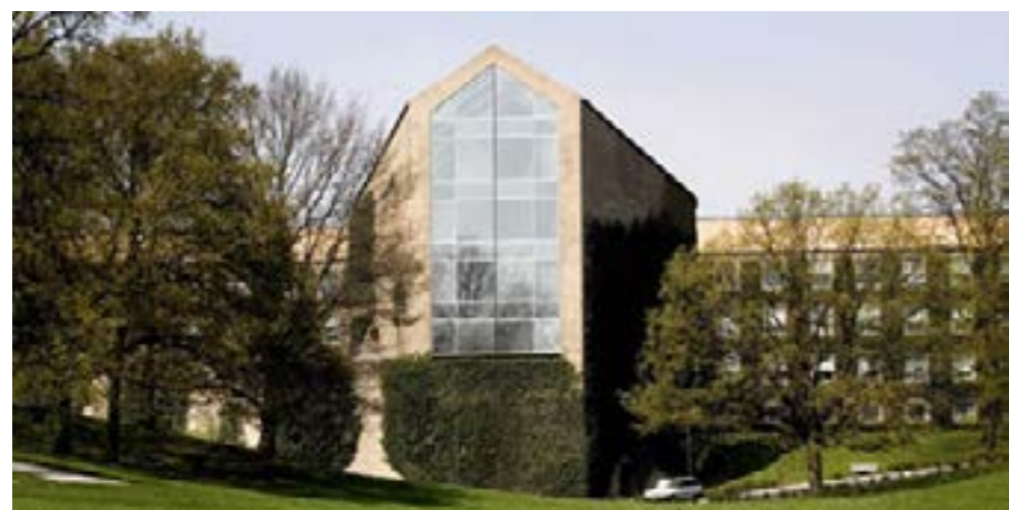
Aarhus University Campus, Denmark

At the beginning of the second year of your studies, a specialism handbook for each of the four specialisms will be published. In this specialism handbook, you will be able to find all the latest information about the specialism university, the study programme and specific practical information.