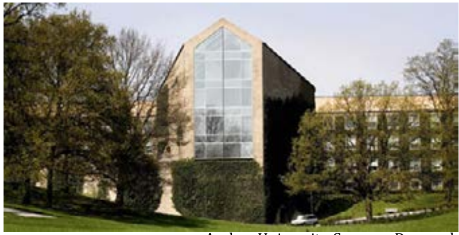
Aarhus University Campus, Denmark

At the beginning of the second year of your studies, a specialism handbook for each of the four specialisms will be published. In this specialism handbook, you will be able to find all the latest information about the specialism university, the study programme and specific practical information.